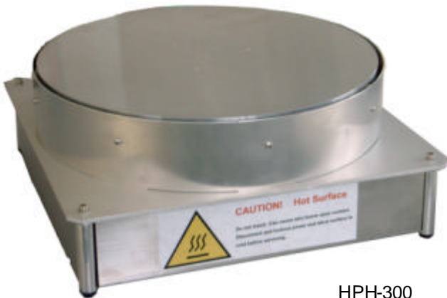
HPH-300 stand-alone version