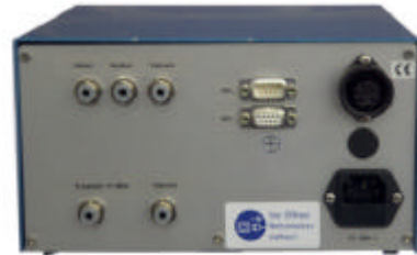
Controller back side